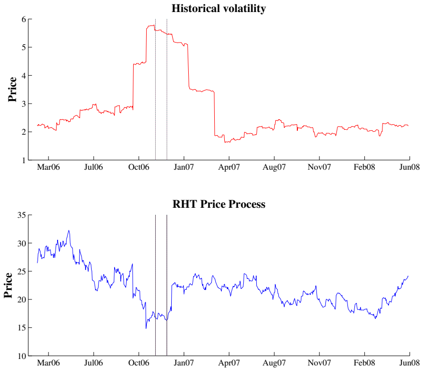
Figure 2: The historical volatility drops drastically after joining NYSE followed by a stable period lasting until now, the longest in Red Hat history.

lines respectively. The price process exhibits less fluctuations and smoother signal after changing into the NYSE. This is translated into narrow Bollinger bands, a sign of stable lower volatility; in contrast with, the wider bands before the release press day; an indication of higher volatility. For the same reason, the second subplot shows that the historical volatility drops drastically after joining NYSE followed by a stable period lasting until now, the longest in Red Hat history, see Figure 2. However, it may be observed that the change of volatility is not immediate and even Bollinger bands became wider before getting narrow, or that in the historical volatility there is an intermediate interval of time before reaching the final level of volatility. This is due to the fast increase in price of the stock during the period immediately after switching the market.